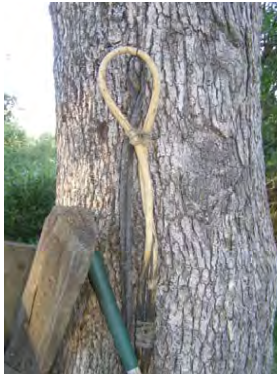
Figure 17 Mono looped stick for stirring acorn mush, made from a young oak sprout, and hanging on a blue oak ( Quercus douglasii ) tree

#CSA1835