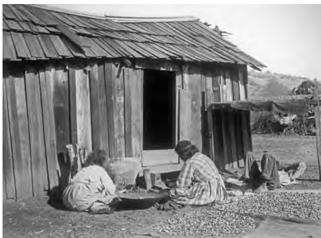
Figure 3 Two Pomo women drying acorns near a wood frame house in November 1892

#06438700