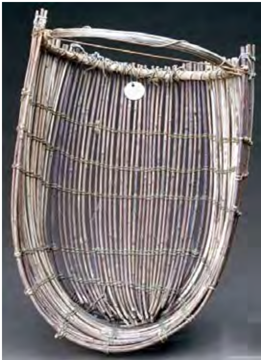
Figure 20 Pomo cradle basket. The reinforcing bar across the top is made of oak.