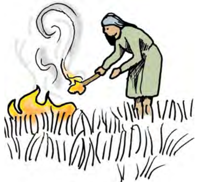
Figure 23 Rendering of a California Indian woman setting a light surface fire in the understory of an oak savanna

Native Americans in the West were well aware that to have the most diverse, healthy, and productive oak woodlands, they had to intervene and actively care for the oaks and the surrounding ecosystems. The most powerful tool they had available to them was fire. Setting frequent, light surface fires in the herbaceous layer of an oak savanna was an ancient practice in California, Oregon, and Washington (fig. 23). Over thousands of years, they learned that by burning regularly under oak trees, they could accomplish at least five objectives, all of which helped maximize acorn production and other useful plants over the long term. Burning could optimize the structure and composition of oak woodlands, facilitate acorn collection, induce the growth of sprouts for material items, control populations of insects that consumed acorns, and control the pathogenic fungi and bacteria that could infect the oaks, sap their vitality, and eventually kill them (Thyssel and Carey 2001; Tveten and Fonda 1999; Anderson n.d.).