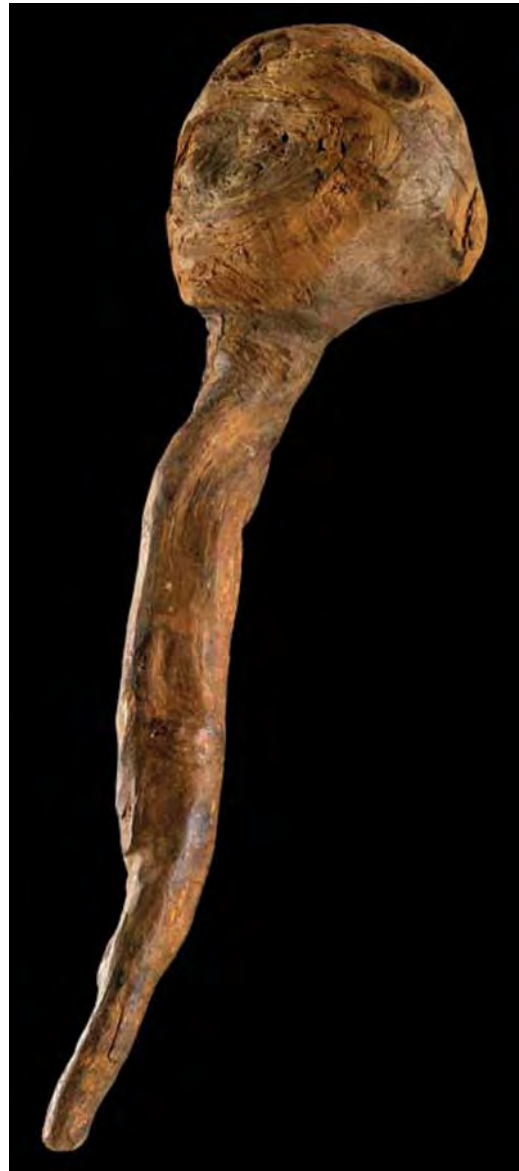
Figure 19 Hupa club made from an oak root