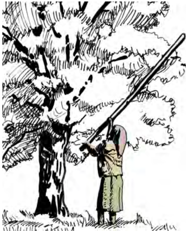
Figure 21 Knocking oaks with long poles to retrieve acorns was a common practice in California, and may have been beneficial to the trees.