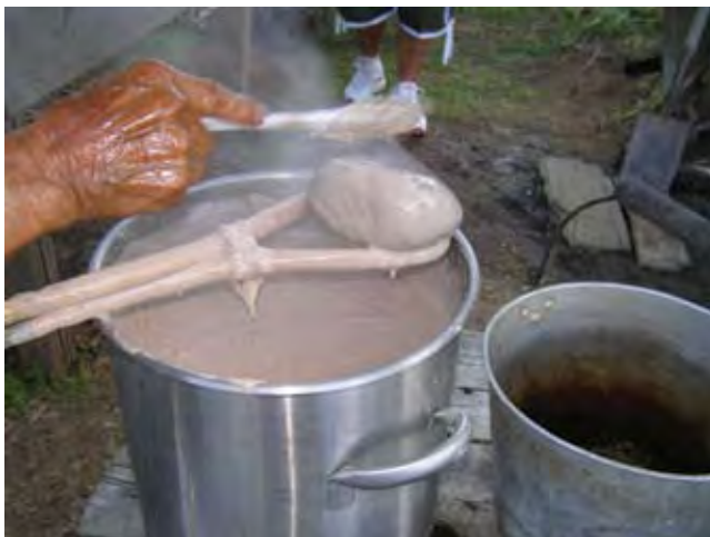
Figure 10 Acorn being cooked in stainless steel pot

Large grassy clearings formed the most important sites for various Indian games of physical dexterity such as archery contests, double ball, shinny, racket ball, football, and the hoop and pole game (Culin 1975). The goal posts or target was located at the ends of a long, grassy field, similar to games of archery, lacrosse, field hockey, and football played today. The goal posts might be of oak, the clubs for hitting a ball down the