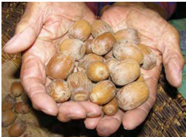
Figure 1 Acorns of California black oak ( Quercus kelloggii )

Some oak species have acorns, such as the gambel oak, that are sweet and do not need leaching. The Navajo boiled their acorns like beans, roasted them over coals, or sometimes dried and ground them into flour (Elmore 1943). The acorns of the Oregon white oak were eaten by the Nisqually, Chehalis, Cowlitz, and Squaxin of Washington. Very bitter and astringent when raw, they were generally cooked by steaming, roasting or boiling (Kuhlein and Turner 1991). The Mid-Columbia Indians of the Columbia Gorge area in Oregon and Washington baked the acorns after leaching them in blue mud (Hunn, Turner, and French 1998).