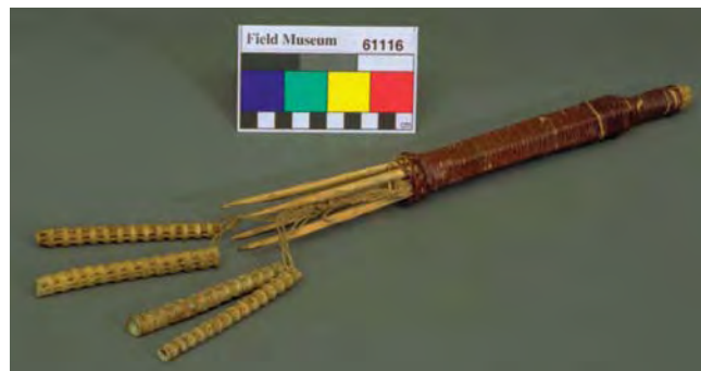
Figure 15 Pomo spearing game. The prongs are made of oak.