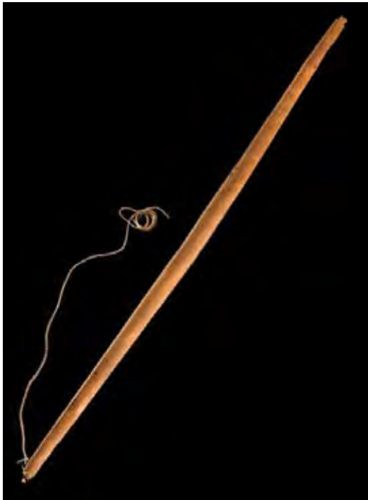
Figure 18 Miwok game bow made of oak and Asclepias

#A114497_02d