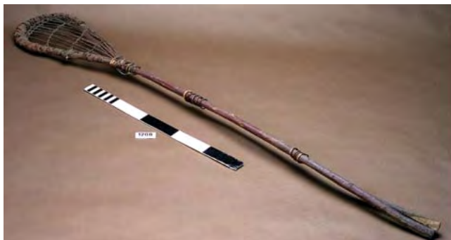
Figure 13 Northern Pomo field hockey racket. The looped frame is probably made of oak.

Courtesy of Field Museum of Natural History, Chicago, IL #A114496_06d