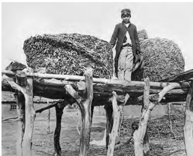
Figure 2 Kumeyaay Granaries for storing acorns circa 1892

#2854B5 Courtesy of Smithsonian Institution, Washington, DC