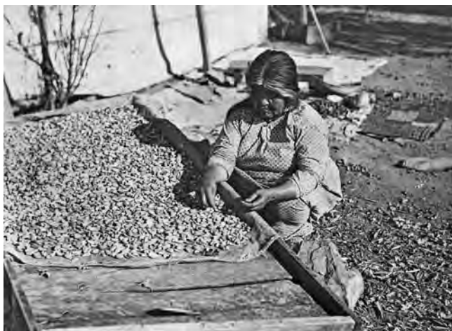
#41887F

These agroforestry systems had an overstory of nut trees and an understory of dense resource patches with one or several dominant useful plants and an array of animals and fungi. Together with other meat and fish resources, this sustained Indian economies. Anthropologist Alfred Kroeber described this working relationship with the landscape that involved both trees and understory plants among the Wailaki: “As spring came on, they [Wailaki] moved into the hills, digging bulbs, beating the prairies for grass and Compositae seeds, and garnering acorns as the summer wore into autumn” (Kroeber 1976).