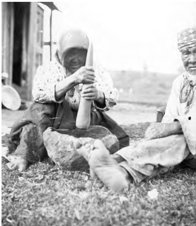
Figure 16 Woman using stone pestle in wooden mortar (probably of oak) to pound acorns

#CSA1835