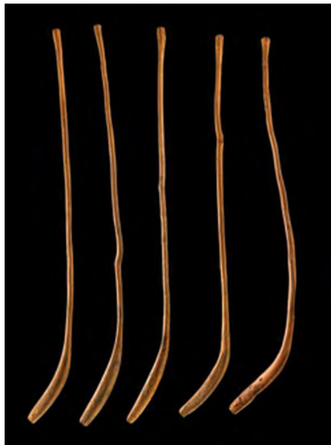
Figure 14 Golf clubs made of oak

Courtesy of Field Museum of Natural History, Chicago, IL #A114496_06d