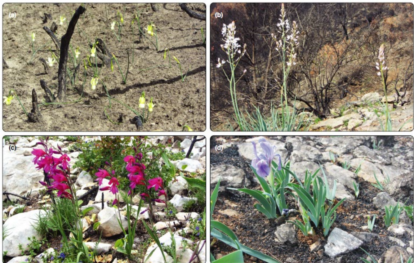
Fig 2. Fire - prone ecosystems are rich in geophytes that flower very quickly after a fire event (fire - stimulated flowering). These species are the first to enhance pollination activity; their underground organs were also an important source of carbohydrates for early humans, and they are the ancestral species of many common contemporary garden plants. Pictured here are geophytes native to Spain that flower quickly after a wildfire: (a) Narcissus triandrus pallidulus , (b) Asphodelus cerasiferus , (c) Gladiolus illyricus , and (d) Iris lutescens