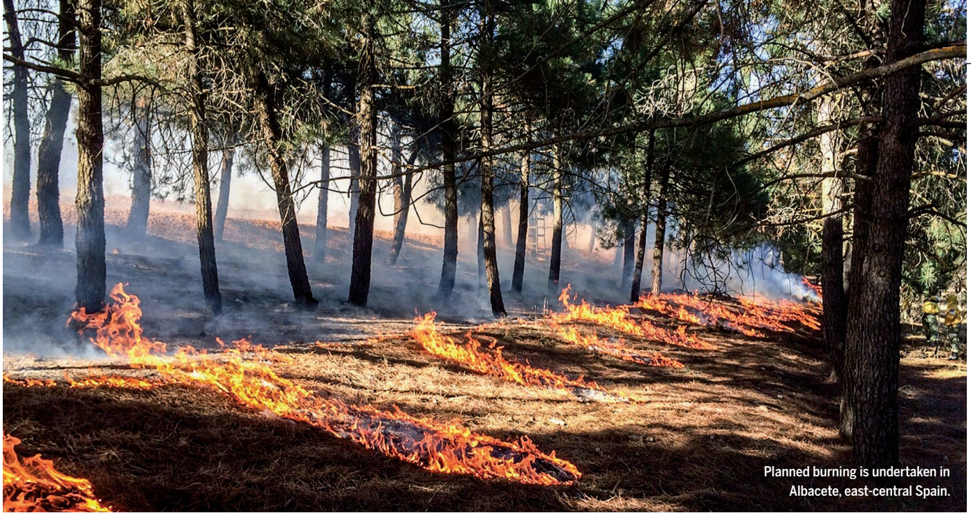
Planned burning is undertaken in Albacete, east-central Spain.