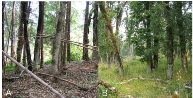
Typical Douglas-fir invaded (A) and intact (B) Oregon white oak woodland, illustrating differences in understory vegetation and fuels, RNP, California, USA.

Pyrometers revealed a decreasing (though not statistically significant) trend in fire temperatures from grassland to invaded woodland, with mean temperatures of over 400°F in grasslands and 370°F in oak woodlands and mean temperatures of less than 170°F in invaded woodlands.