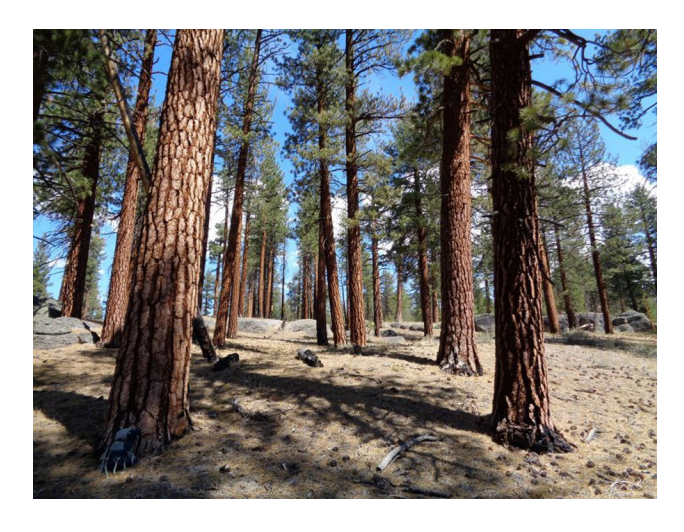
Figure 2. Jeffrey pine stand within a prescribed fire unit in the Indiana Summit RNA, Inyo National Forest.

Although the focus of this study was California RNAs, the results and recommendations are likely applicable to many protected natural areas in the western United States. The long-term exclusion of fire from historically frequent-fire ecosystems, as well the increase in fire frequency in ecosystems adapted to long fire-free periods, puts many of the ecological values within RNAs at risk of degradation or loss. In many cases, monitoring and proactive resource stewardship are essential to ensure that disturbance processes, such as fire, can proceed in an ecologically beneficial manner.