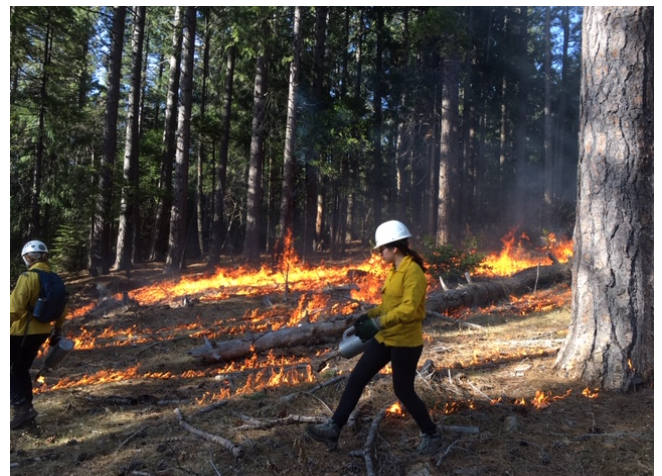
Fig. 1. Prior to this winter burn, the mid-story was removed. The burn was feasible because of the “pyrosilviculture” preparation of forest structure. A sparse mid-story, like the tanoak seen behind the burner on the right, has developed and persists even with high frequency burning (every ~3 years).